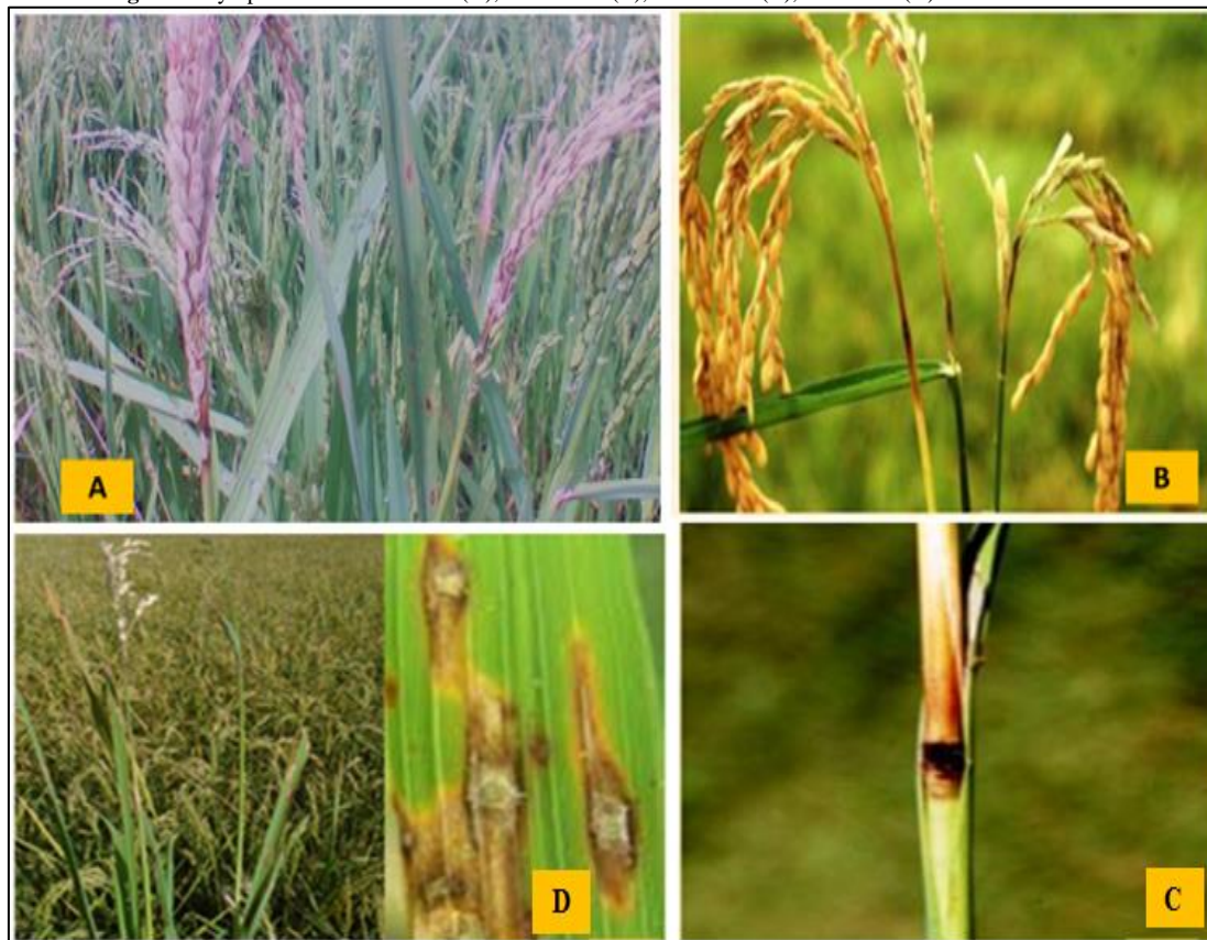
Figure-3. Symptoms of Panicle blast (A), Neck blast (B), Node blast (C), Leaf blast (D) disease in rice field

Neck blast and node blast are characterized as brown color and rot symptom that affects and disorganizes the tissues of rice stem and prevents the migration or translocation prepared food and minerals that should ensure grain filling to contribute for increasing yield. This leads to early maturity of the panicles, causing indirect and seldom quantified yield losses through grain shedding. Neck blast is considered more destructive than leaf blast, because it is more closely tied to yield losses [13].