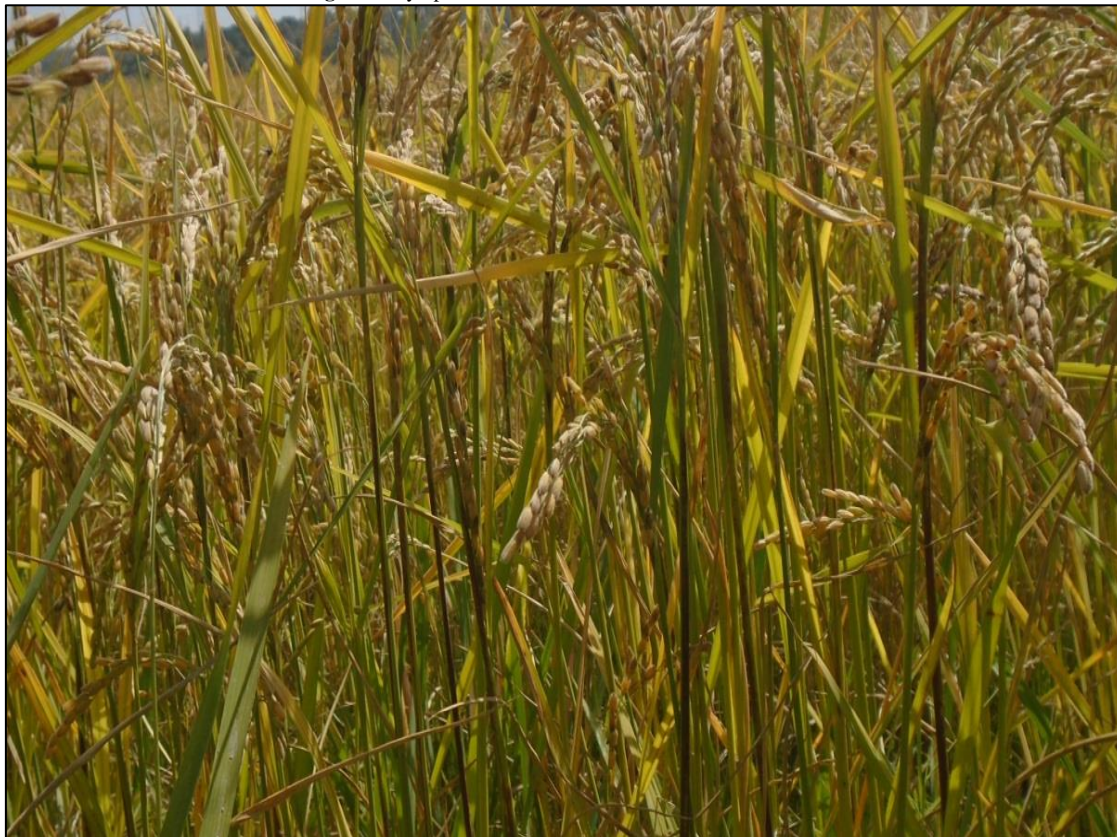
Figure-2. Symptoms of sheath brown rot disease in rice field