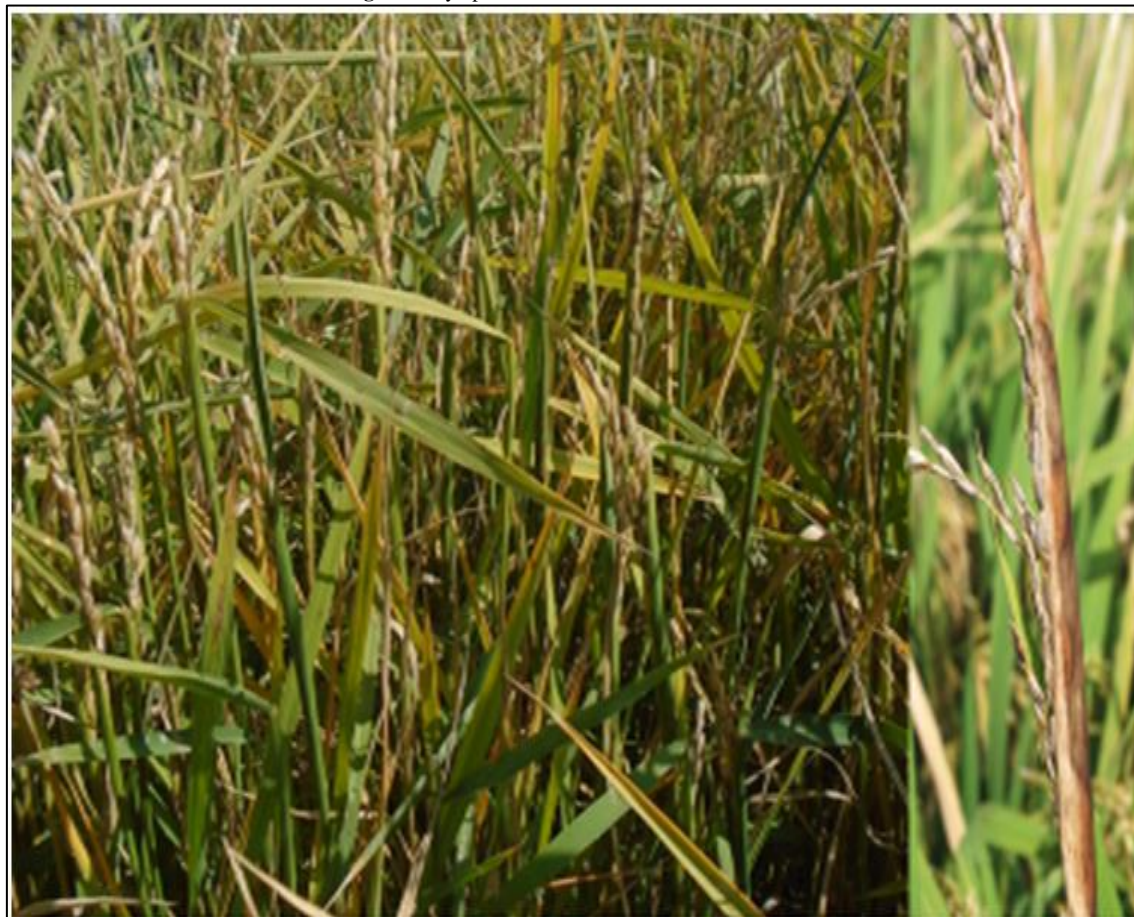
Figure-1. Symptoms of sheath rot disease in rice field

The major symptoms caused by sheath rot on rice are described according to Ou [8]: the rot occurs on the uppermost leaf sheaths enclosing the young panicles; the lesions start as oblong or somewhat irregular spots with brown margins and gray centers, the young panicles remain within the sheath or only partially emerge (figure 1). It is infection results in chaffy, discolored grains, and affects the viability and nutritional value of seeds [9, 10].