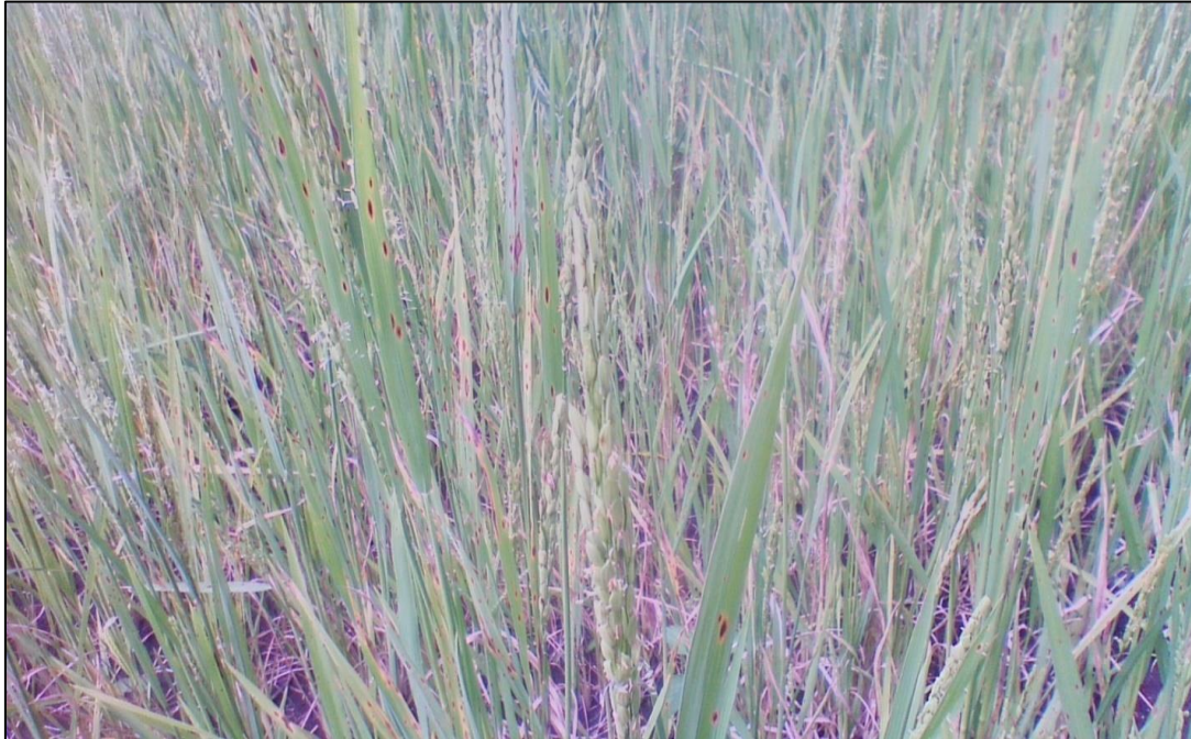
Figure-4. Symptoms of Brown spot disease in rice field

Brown spot is a fungal disease that infects all parts of plant. Its most observable damage is the numerous big spots on the leaves which can kill the whole leaf. When infection occurs in the seed, unfilled grains or spotted or discolored seeds are formed. Infected seedlings have small, circular, yellow brown or brown lesions that may girdle the coleoptile and distort primary and secondary leaves. Starting at tillering stage, lesions can be observed on the leaves. They are initially small, circular, and dark brown to purple-brown. Fully developed lesions are circular to oval with a light brown to gray center, surrounded by a reddish-brown margin caused by the toxin produced by the fungi [1].