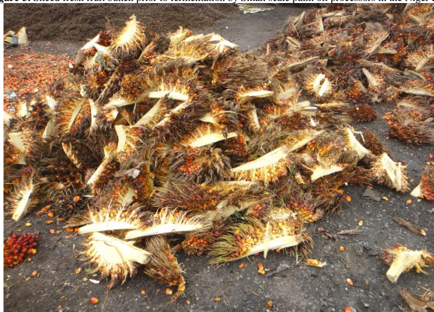
Figure-3. Sliced fresh fruit bunch prior to fermentation by Small scale palm oil processors in the Niger Delta