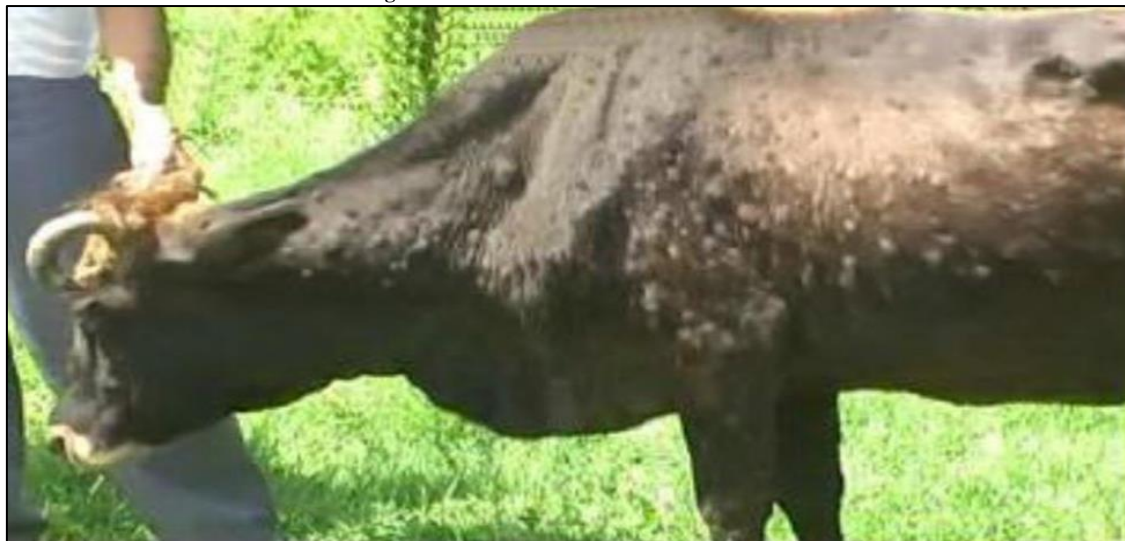
Figure-2. Nodules on neck and abdominal areas

Papules most easily observed in hairless areas of perineum, udder, inner ear, muzzle and eyelids [52]. Some cattle can develop edematous swelling of legs that causes lameness. Severity of infection is more in cows at peak lactation that can reflect it through a sharp drop in milk production. This drop in milk production is usually associated with the higher fever (i.e. 40 to 41 oC) and mastitis due to secondary bacterial infection [23]. In bulls, LSD could cause infertility temporarily though severe orchitis may cause a permanent sterility. This disease also has an effect on pregnant cows by causing either abortion or anoestrus for several months. Additionally, pneumonia may be observed as a result of secondary bacterial complications of upper respiratory tract that undergoes extensive necrosis. Even after recovery of this respiratory signs, stenosis of trachea has been reported following the healing of lesions by scar formation (Center for food security and public health/[41]). Generalized clinical signs, that are unspecific to LSD, are also common. These are depression, disinclination to move, inappetence, salivation, lachrymation and a nasal discharge, which may be mucoid or muco-purulent.