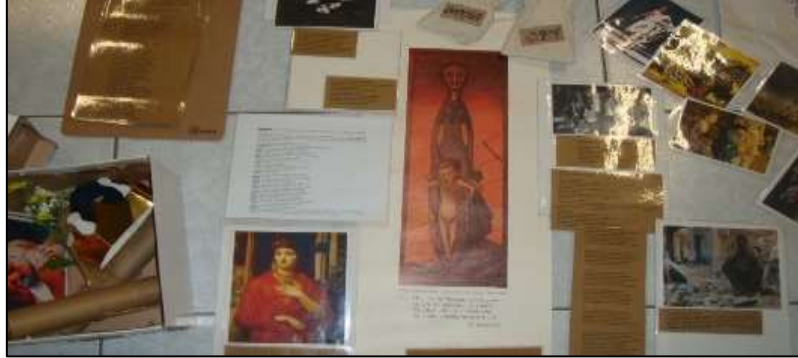
Figure-1. Educational material

During the activity the most important was the fact that among the participants there was 16 year old student, a Syrian refugee, living in the hot-spots for youths in the area of Imathia and it was his second week of attendance at the school. Even though he didn't speak Greek, he responded very well to the demands of the course doing his best. His fellow-students helped him and very quickly he became a part of the team without any problem. According to me this is a strong example to make us realize how drama and theater can on the one hand be vital at schools as it can socialize, diminish the discriminations and racism among the students and give them the stimulus to see life from a different perspective, to realize that love, understanding, cooperation and help can make the difference.