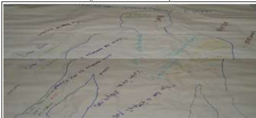
Figure -2. «hero's character script»

They made a sketch of her, within it they wrote down how they imagine that Helen feels and what she believes, while outside the sketch they showed out what the people think about her.