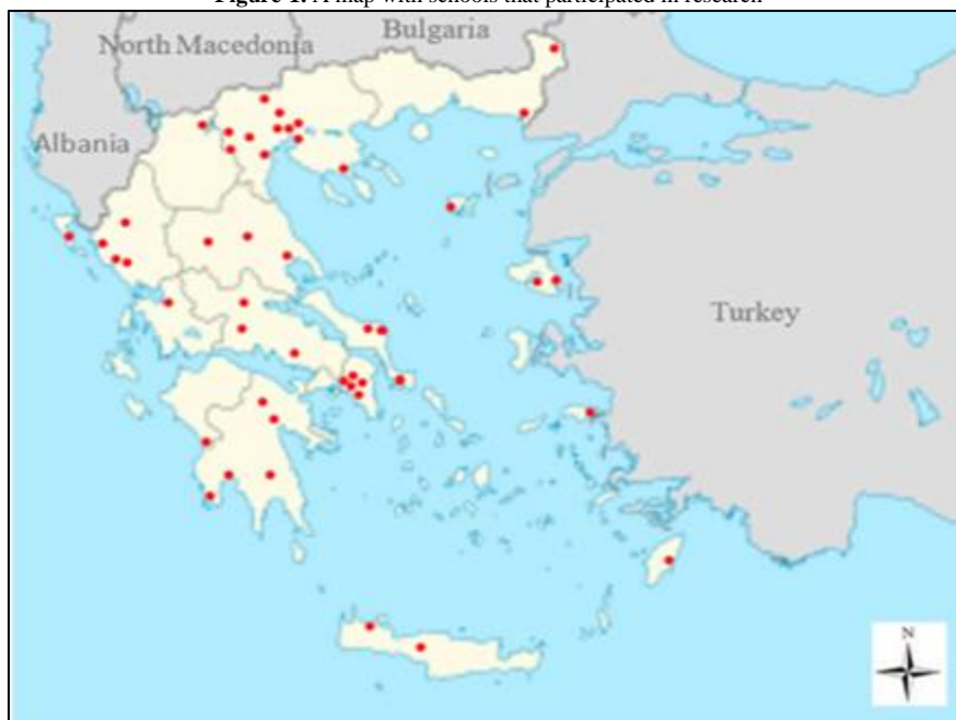
Figure-1. A map with schools that participated in research

Subsequently, the students' answers about their familiarity with computers were categorized. It was observed that most students stated high familiarity with computers (82.8%). It is worth noting that only six students stated that are little familiar with computers. In addition to students' preference for the subject of Geography, 78.6% of the students stated that they like Geography, whereas only 14 students stated that they like it little.