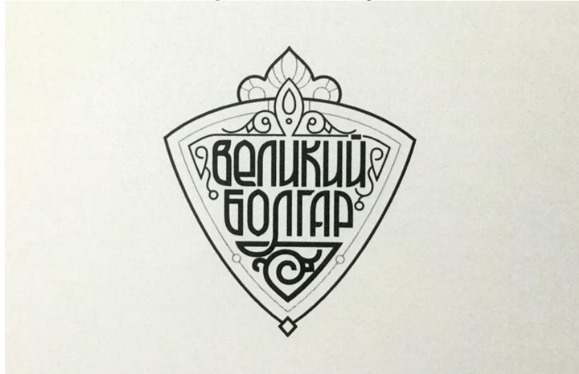
Figure-6. Brand "Great Bolgar"

The creation of brands "Great Bolgar" and "Island-town Sviyazhsk" will contribute to the further development of domestic infrastructure, and the promotion of cities Sviyazhsk and Bolgar as powerful tourist centers in the territory of the Republic of Tatarstan.