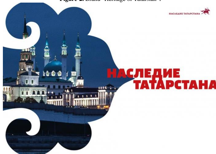
Figure-2. Brand "Heritage of Tatarstan".

The first brand of Tatarstan was developed in 2014 and had the name “Heritage of Tatarstan”.