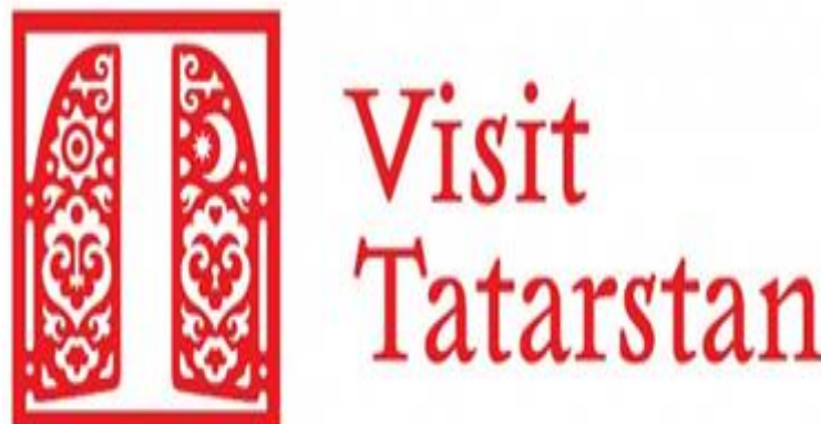
Figure-3. Brand "Visit Tatarstan".

Graphically, the brand "Visit Tatarstan" is as follows (Figure 3).