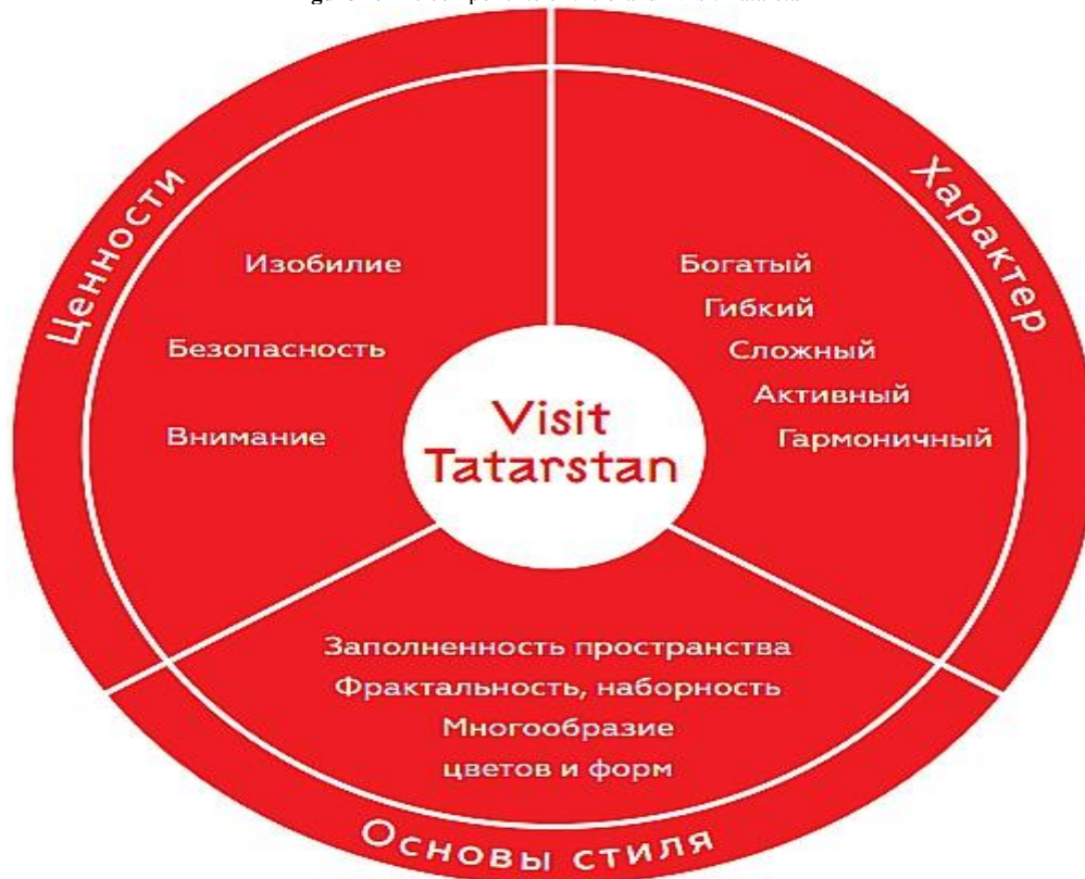
Figure-4. The components of the brand "Visit Tatarstan"

The presentation of the official tourist brands "Great Bolgar" and "Island-town Sviyazhsk" was held on November 16, 2016 at the hotel “Relita-Kazan”. These brands were created as a part of the implementation of the Visit Tatarstan program, aimed at promotion of tourist opportunities of the Republic, and at the further development of tourism industry in Tatarstan (Bagautdinova et al. , 2012).