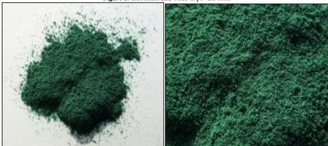
Figure-2. Chromium (III) oxide in powder form

Chrome tanning with chromium (III) salts accounts for around 85 percent of global leather production (as per 2014). 95% of shoe upper leather, 70% of leather upholstery (but decreasing in favour of FOC-leather) and almost 100% of clothing leather are chrome tanned. Although it has twice the tensile strength of vegetable tanned leather, chrome-tanned leather weighs less because the skin does not fully absorb the chromium salts used for tanning. The tannin makes up just 4% (with newer leathers only about 1.5%) of the leather weight, while vegetable-tanned leather has a tannin content of about 20 percent. Chrome-tanned leather is more easily hydrophobized compared to other tanning alternatives and the leather can be softened more easily. The tanning process is faster and requires less tanning chemistry than vegetable-tanned leather. Freshly tanned wet blue with its characteristic bluish tin is globally transportable and can be stored well. This facilitates unlimited international sales and global processing [16]. Digital images of chrome tanning in the tanning drum are presented in Figure 3.