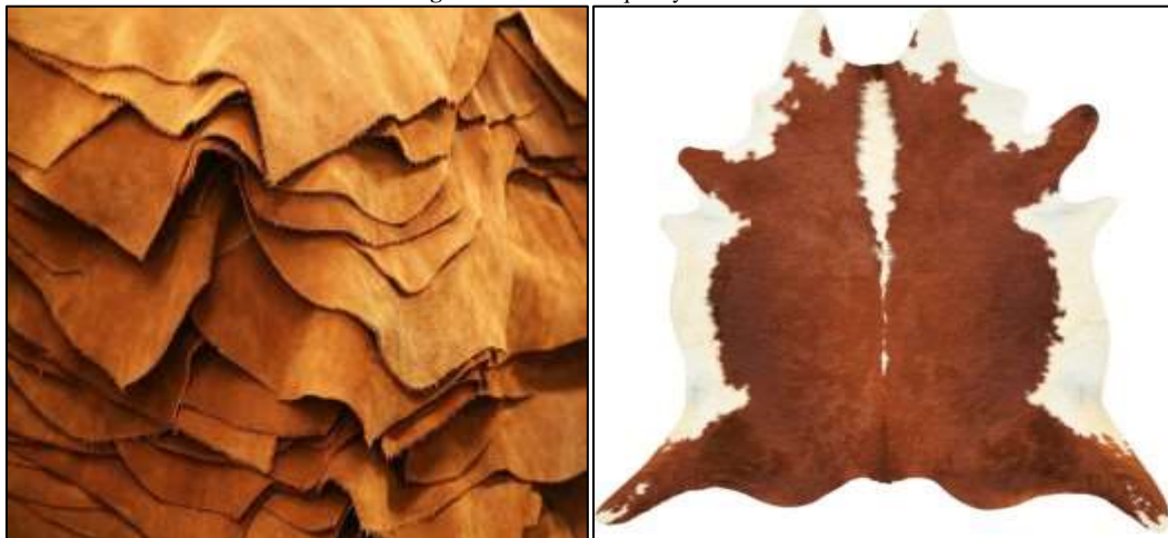
Figure-1. Nature and quality of leather

The quality and nature of leather depend on various factor such as type of hides (either bullhide or cowhide), Origin (Depends on health of animal), quality of rawhides, method of tanning either vegetable tanning or chrome tanning.